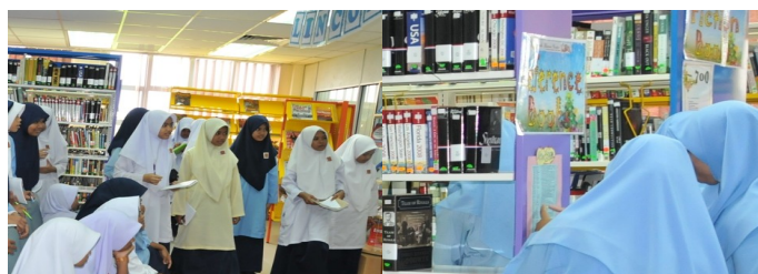
School students listening to briefings and browsing through the Lincoln corner collection

In April, the Lincoln Corner in Melaka hosted about 100 students and teachers from Sekolah Menengah Dewan Beta and Sekolah Kebangsaan Dato Demang Hussin for briefings about the programs and services and a tour of the collection. During their visit, they also enjoyed observing poster shows on Earth Day and Jazz Appreciation Month. In addition, the students participated in an educational quiz about America led by Corner librarians.