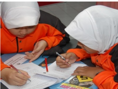
Students engaged in an interactive quiz about American life and culture

On April 5 and 12, the Lincoln Corner in Kedah hosted about 100 students and teachers from Sekolah Kebangsaan Bukit Raya Dalam and Sekolah Kebangsaan Haji Mohd Shariff for briefings and a tour of the Lincoln Corner. During their visit, the guests enjoyed observing a poster show on Earth Day and participated in an educational quiz about America.