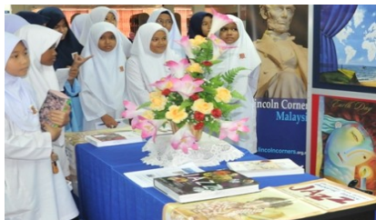
School students viewing the colorful earth day posters

Throughout the month of April, Lincoln Corner Melaka organized a book display and poster exhibition to commemorate Earth Day and Jazz Appreciation Month. More than 100 students and library users viewed the exhibition.