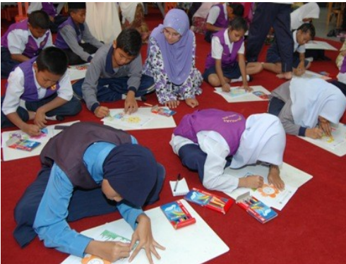
Participants engaged in Earth Day coloring and art & craft activities

On April 7, Lincoln Corner-Kedah reached out to about 300 students from several schools around Alor Setar during a roadshow on U.S. Culture. The students learned many different aspects of America from a display on "Picturing America" and through participating in educational activities depicting U.S. History.