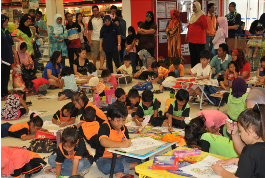
Participants engaged in the Mother's Day activities at TESCO

On May 29, 100 children and their parents participated in Lincoln Corner Mother's Day activities held at TESCO Shopping Centre. They enjoyed the day filled with fun activities ranging from storytelling to coloring to card-making contest.