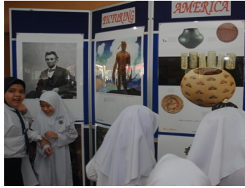
Picturing America Exhibition

On April 7, Lincoln Corner-Kedah reached out to about 300 students from several schools around Alor Setar during a roadshow on U.S. Culture. The students learned many different aspects of America from a display on "Picturing America" and through participating in educational activities depicting U.S. History.