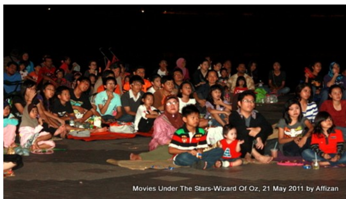
A captivated audience at the movie screening

On May 21, Lincoln Corner-Sarawak reached out to about 550 children and adults through their movie screening entitled Movies Under The Stars @ Lincoln Corner Sarawak 2011 . The Corner screened "The Wizard Of OZ", a famous American musical fantasy film featuring a little Kansas farm girl, Dorothy Gale, and her dog Toto. Before and after the movie screening, the audience participated in quizzes and games organized by the librarians. This program also featured special appearances by American heroes and cartoon characters including Batman, Superman, Bert and Ernie.