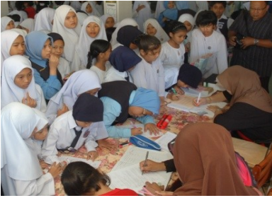
Students participate in the United States Word Search activity