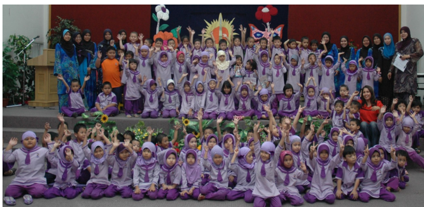
"Just like Mama", exclaim young participants at Lincoln Corner's storytelling session.