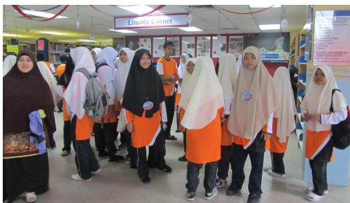
Young Librarians from SMK Daerratul Maarifil Wataniah at Lincoln Corner, Seberang Jaya.

A librarian and the staff from Kolej Politek MARA visited Seberang Jaya Library on May. They viewed the collection and signed up for membership.