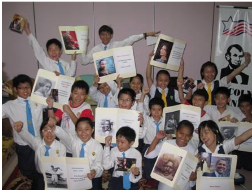
Participants posing with their activity folders and Obama postcards