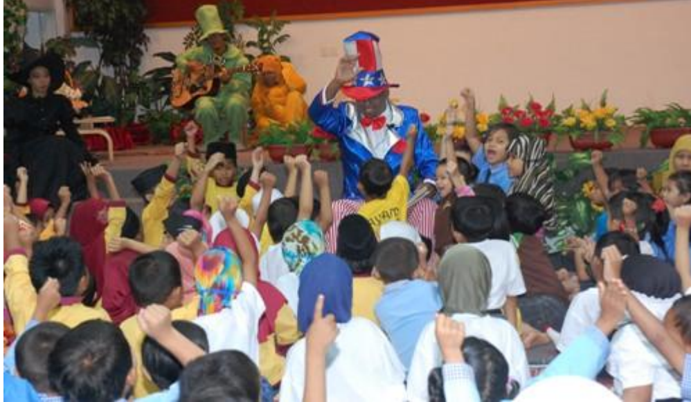
'Young democracy in action!' Participants vote for Uncle Sam to be their next 'American Idol.'