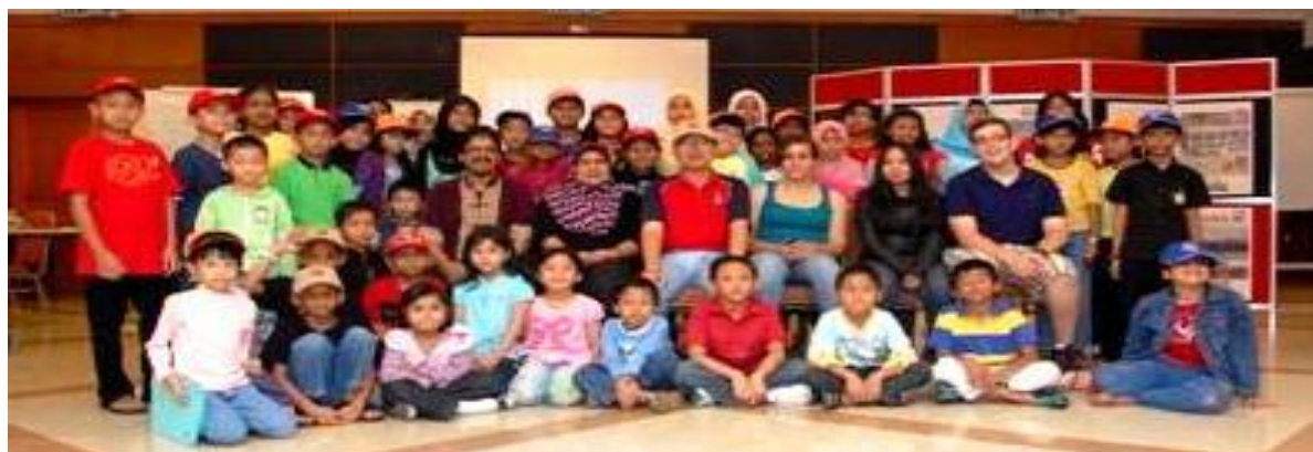
Young Malaysians Enthralled at English program on climate change

To raise awareness of Global Climate Change, young Malaysian participants actively joined a series of "hot" and interesting English-language learning exercises at the Lincoln Corner Kuala Lumpur's English Conversation Hour program featuring YES Abroad American students. On a bright Sunday morning (Dec 20 th ), forty young participants learned the ABCs of climate change, read excerpts such as "So What Exactly Is Global Warming--Our Planet is Heating Up" (from an American English-language easy-reader